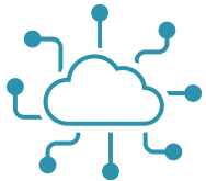
TECHNOLOGY & MOBILITY