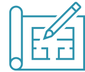
CONCEPTUAL TO FINAL DESIGN