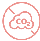
SUSTAINABLE DESIGN & ZEB SUPPORT