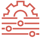
MASTER PLANNING & PROGRAMMING

With a full spectrum of in-house services, STV provides our clients with expertise to go from planning to revenue service.