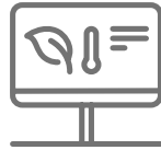
ENVIRONMENTAL STUDIES & - REMEDiation